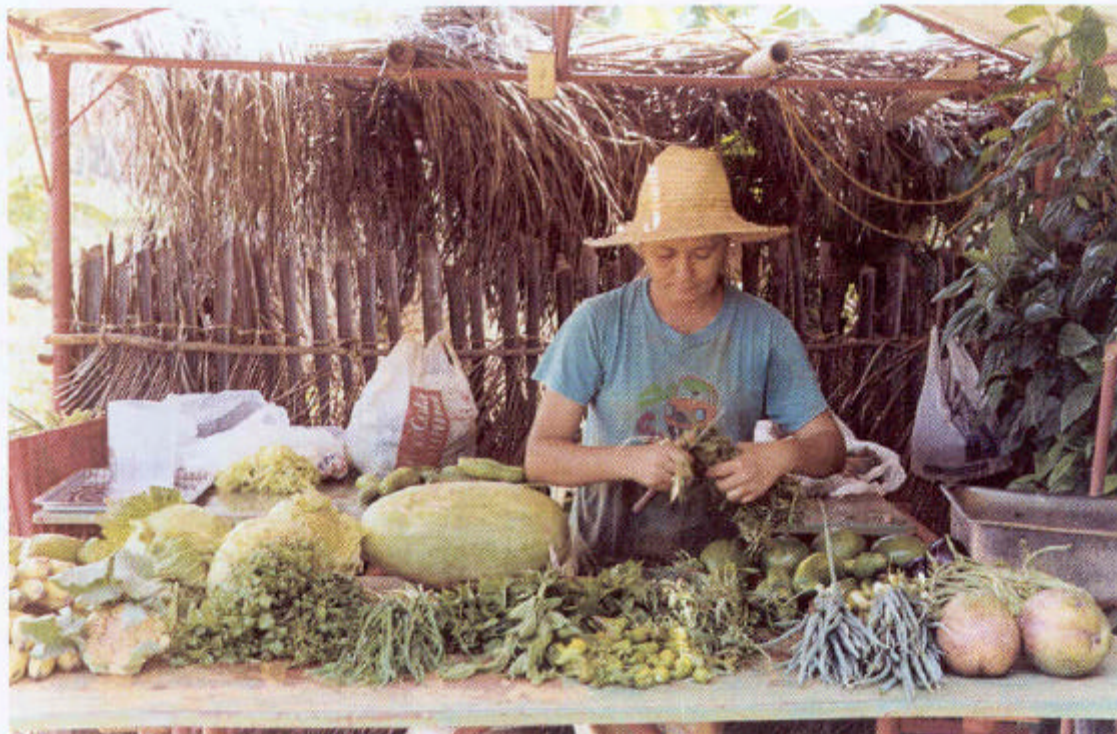
Marketing point part of the concept "Production of the neighborhood for the neighborhood".