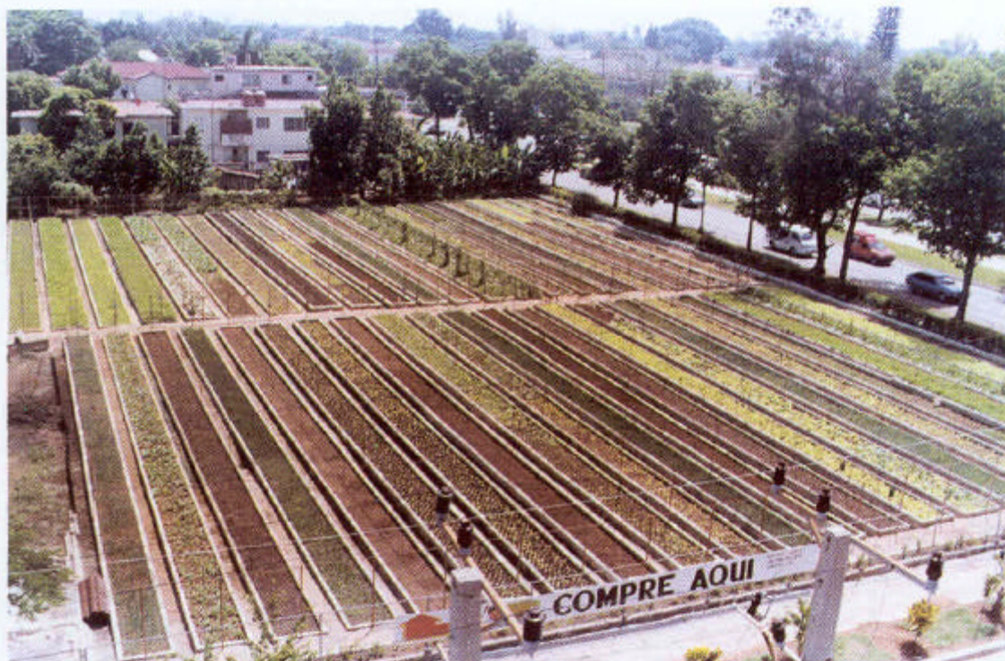
Organopónicos INRE 1. One of the 20 existing organopónicos in Havana.